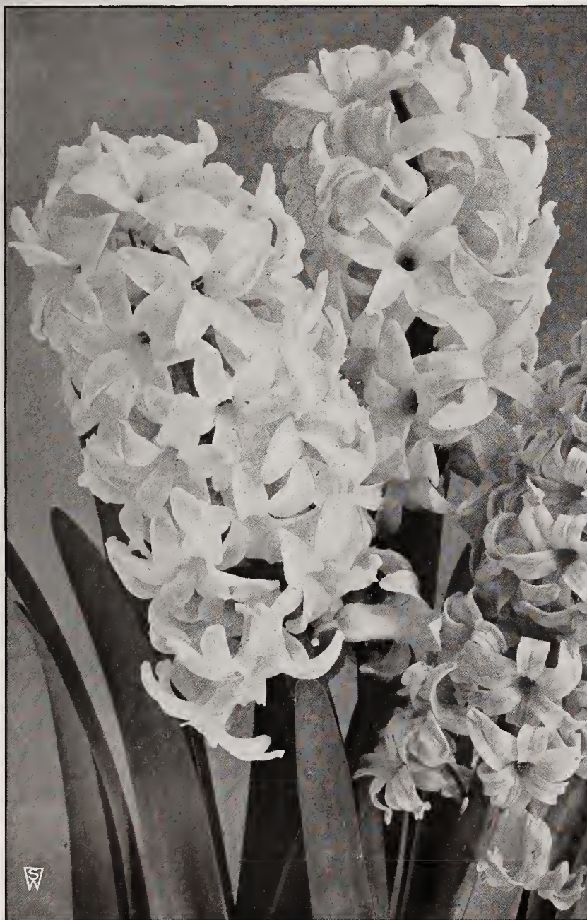
These large spikes of Dutch Hyacinths were produced from our Exhibition Grade

YELLOW HAMMER. 1. Creamy yellow; compact spike and large bells.